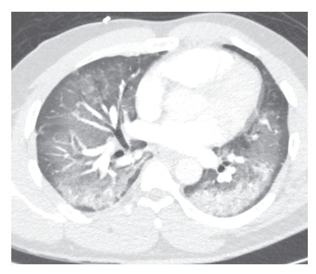
Fig. 2. Computed tomographic angiography revealing widespread bilateral ground glass opacities.

The patient was reexamined and his social history was revisited. He remained in moderate respiratory distress without any significant change in his physical examination. He continued to vehemently deny cocaine abuse as well as risk factors for the human immunodeficiency virus. His urine toxicology screen returned positive for cocaine. When confronted with these results, the patient admitted to smoking crack cocaine immediately prior to the onset of his symptoms. His ultimate diagnosis was acute pulmonary injury secondary to inhaling cocaine, colloquially known as "crack lung."