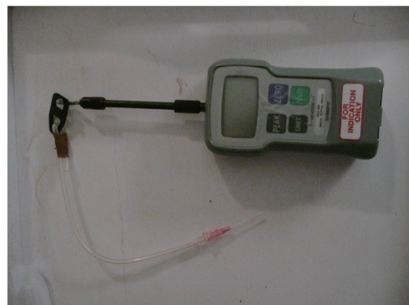
Fig. 1. Force transducer and cannula attachment.

With the “Horizontal Taping” technique, the first tape was applied horizontally across the cannula below the notch anteriorly. The adhesive dressing